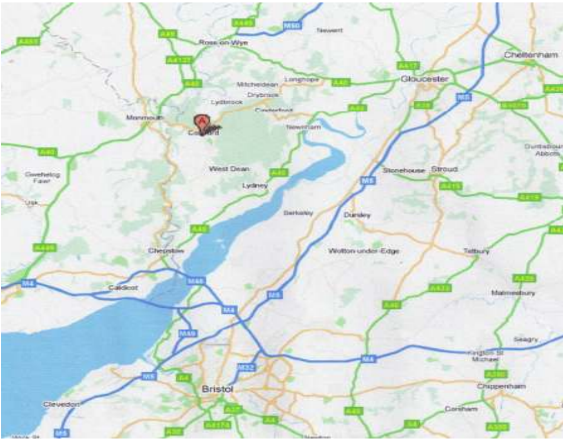
Direction maps to venue